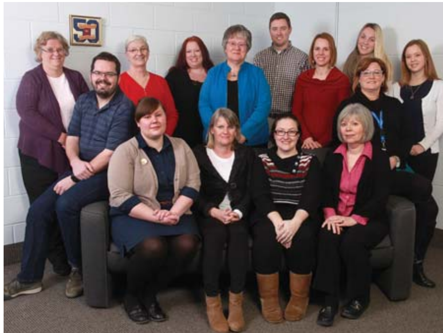
School of Nursing Staff 2016