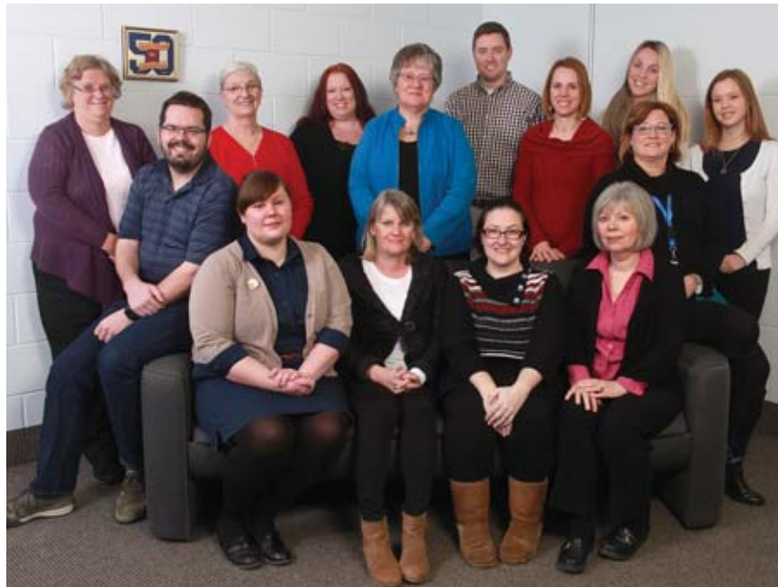
School of Nursing Staff 2016