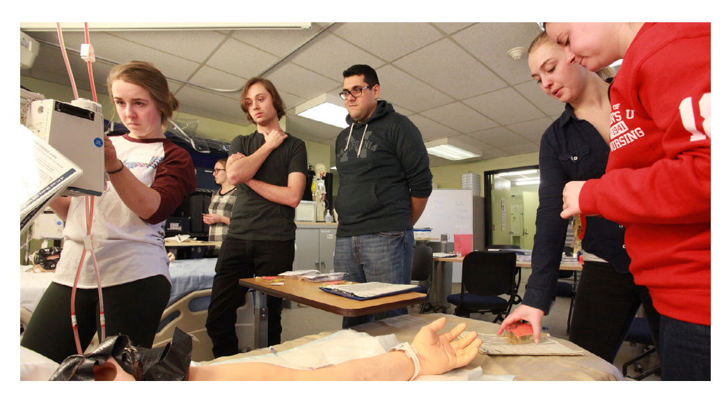
Be part of a tradition of Nursing excellence that is over 75 years old.

Please also see our website for the admission policy for Indigenous candidates.